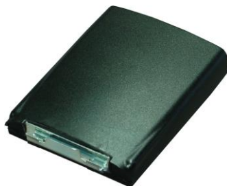
Battery fitted with new BiTEA battery clip