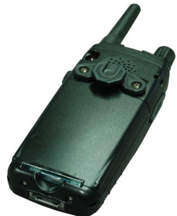
Battery back in service