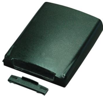
Broken clip on SRH or SRP radio batteries

The clips are fixed to the battery using 3M 468MP Transfer Tape which is a firm acrylic pressure-sensitive adhesive system. It features high ultimate bond strength with excellent high and low temperature performance and excellent solvent resistance. Bond strength increases substantially with natural aging. Price: £5.00 per clip sold in packs of 10. Minimum order £50.00 + vat